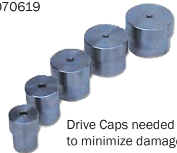
Drive Caps needed to minimize damage