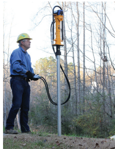
Use of optional remote valve (801011) with HPD 60.