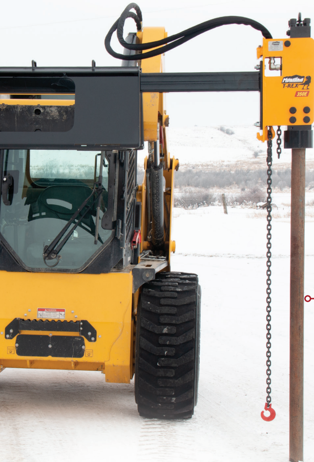
Side Extension T-REX 350E

The ORIGINAL Hydraulic Hammer Post Driver