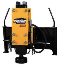
1000E Post Driver