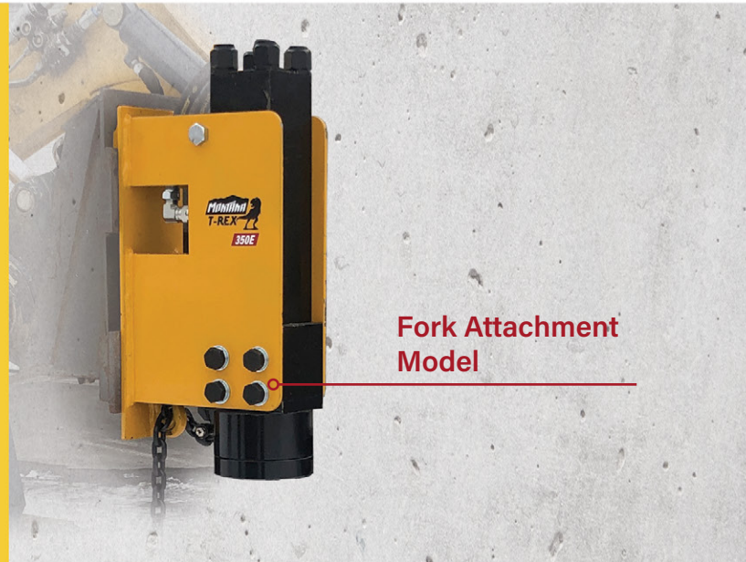
Fork Attachment Model