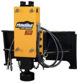
750R Rancher Post Driver