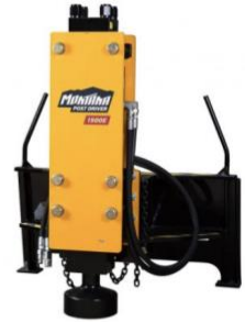
1500E Post Driver

The Montana Post Driver is a serious productivity tool built on hydraulic concrete breaker technology, enabling you to install fence posts even in hard and rocky ground. We have seen experienced crews run at rates up to 2 posts per minute in favorable conditions. Attaching one of these post drivers to a skid loader can be done in less than a minute. Choosing a Montana Post Driver will give you ease-of-use, longevity, and optimum efficiency.